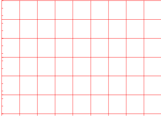
FIG.7: Relative variations of gate trigger current, holding current and latching current versus junction temperature