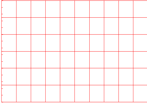
FIG.7: Ratio of gate capacitance to input capacitance